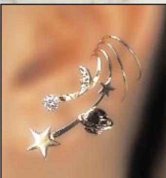
#4X-GAL-CZ. The Long Wave with Galaxy and Cubic Zirconia.

Stars, moon, Saturn, brilliant 4 mm Cubic Zirconia and the reflective Lightning Bolt, dangling at the end of the lobe. (all one piece).