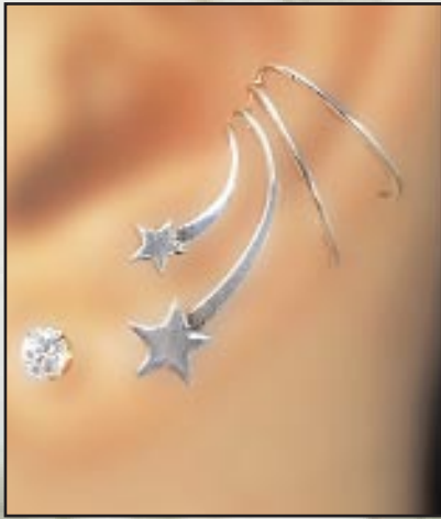
#4-ST. The Short Wave with Stars Fun with other earrings or for mix and match.