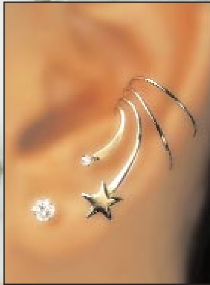
#4-ST-CZ. The Short Wave with a Star and Cubic Zirconia.

One 2 mm Cubic Zirconia and one star. Nice with other earrings, but really fun as a mix and match with any of our Star or Galaxy styles.