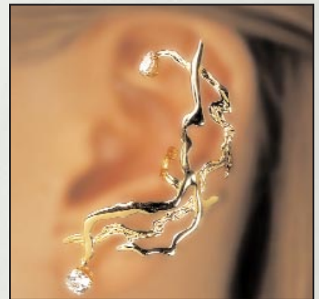
#45-CZ. Lightening bolt with Cubic Zirconia.

Striking! It has one pear shaped and one large 5 mm round Cubic Zirconia. Carved and lost wax cast. Fits a little differently on either ear.