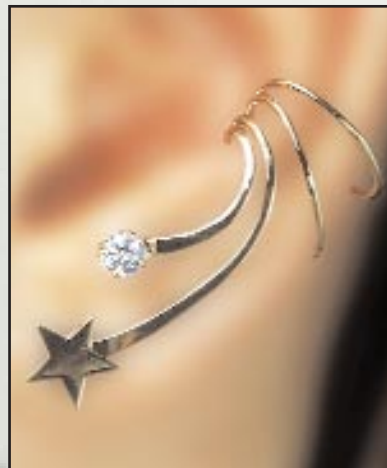
#4X-ST-CZ. The Long Wave with a Star and Cubic Zirconia.